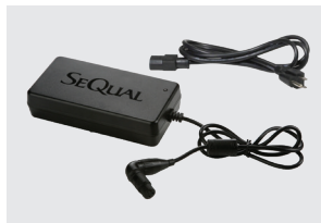
AC POWER SUPPLY