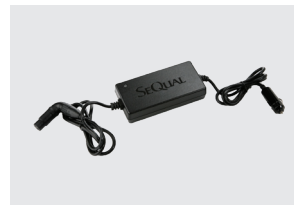
DC POWER SUPPLY