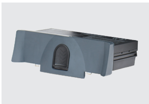
POWER CARTRIDGE (BATTERY)